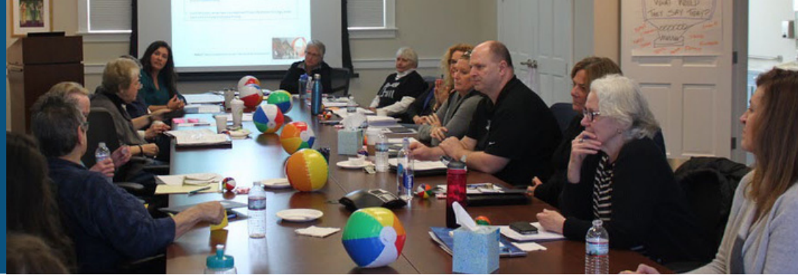
2019 Board Retreat

We are blessed with a long list of supporters and volunteers. This year we converted to a new database, so if you notice an error, we apologize. Please let us know so we can correct any oversights.