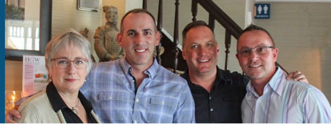
The Crowne Pointe Dinner Hosts