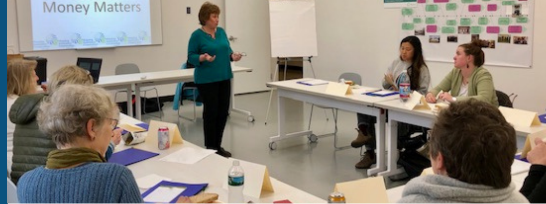
Money Matters - Financial Well-Being Program