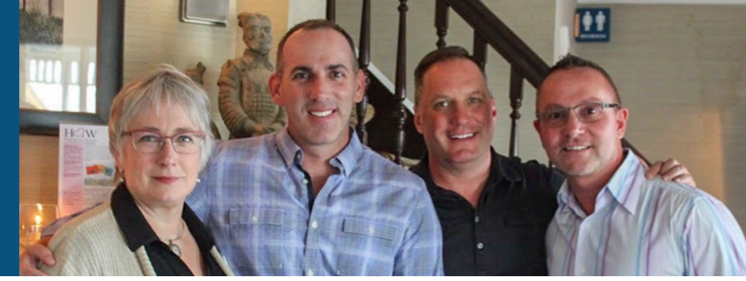
The Crowne Pointe Dinner Hosts