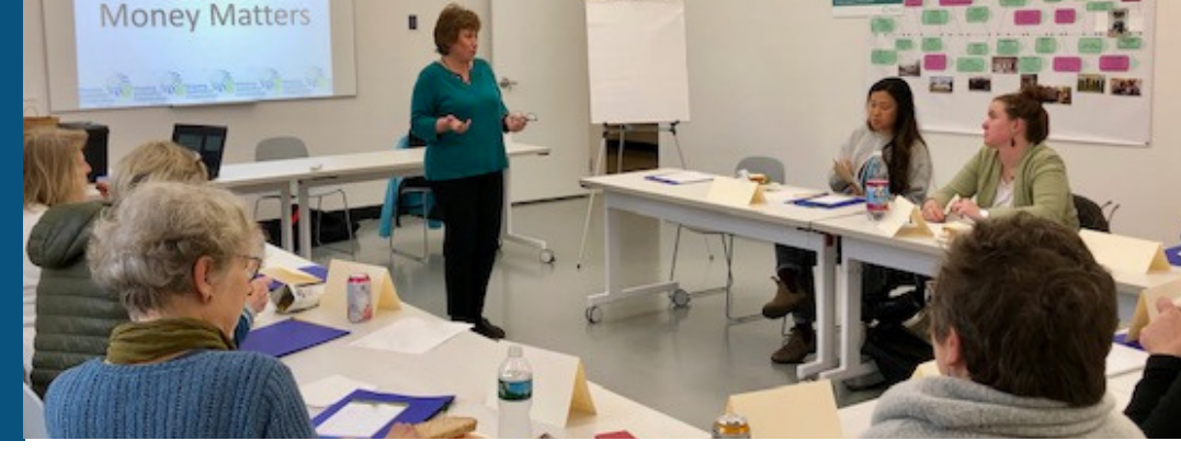
Money Matters - Financial Well-Being Program